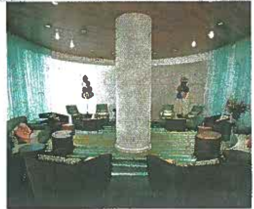
DANESE KENON / The Star